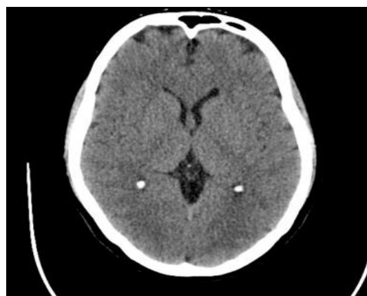
Fig. 1: Normal NCCT Head

Diagnostic laryngoscopy with biopsy was done and on histopathological examination, it was squamous cell carcinoma moderately differentiated type. Patient underwent total laryngectomy with chemoradiation.