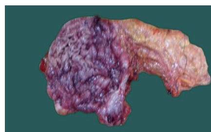
Fig. 2: Specimen