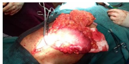
Fig. 1: Intra Operative Picture

stomach. So we did IHC for this specimen came as Non Hodgkins Lymphoma B cell type. After surgery patient sent for medical oncologist opinion, their opinion was Non Hodgkin lymphoma affecting stomach (isolated involvement of stomach –likely). So CECT –neck, thorax, bone marrow study –not needed, patient was started on CHOP regimen. Now patient is on chemotherapy. Patient is well responding to chemotherapy.