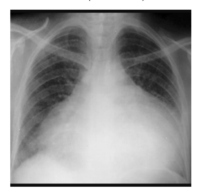
Fig. 1: Chest X ray suggestive of pericardial effusion

ECG showed heart rate of 78/min with low voltage complexes with electrical alternans. 2d echocardiography was done showed small sized heart with massive pericardial effusion and signs of early diastolic right ventricular collapse which is echocardiographic hallmark of cardiac temponade (Figure 2). CECT thorax was done to rule out local malignancy presenting as pericardial effusion which showed pericardial effusion with drainage cathether in situ with sub centrimetric mediastinal lymphadenopathy with bilateral pleural effusion with sub segmental collapse. Thus a provisional diagnosis of massive peri cardial effusion with cardiac tamponade was kept. Immediately the patient was taken for pericardiocentesis. Around 1.1 litre of pericardial fluid through xiphisternal route was removed under aseptic precautions under cardiac monitoring and pigtail cathether was kept in situ for further draining of fluid. Pericardial fluid was golden yellow in appearance ("Gold Paint" effusion). Immediately after fluid removal patient cardiopulmonary status improved significantly. Follow up 2d echo showed minimal pericardial effusion with no evidence of cardiac tamponade.